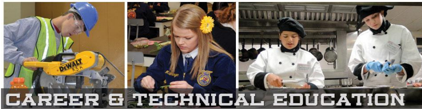
CAREER & TECHNICAL EDUCATION